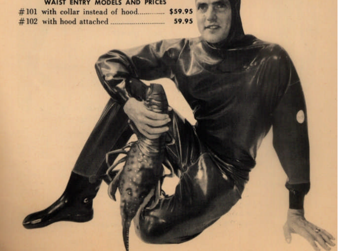
Bel-Aqua Full-Length Waist-Entry Suit