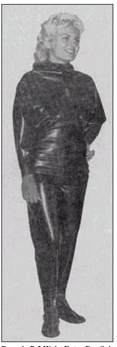
Penguin P-2 Waist Entry Dry Suit